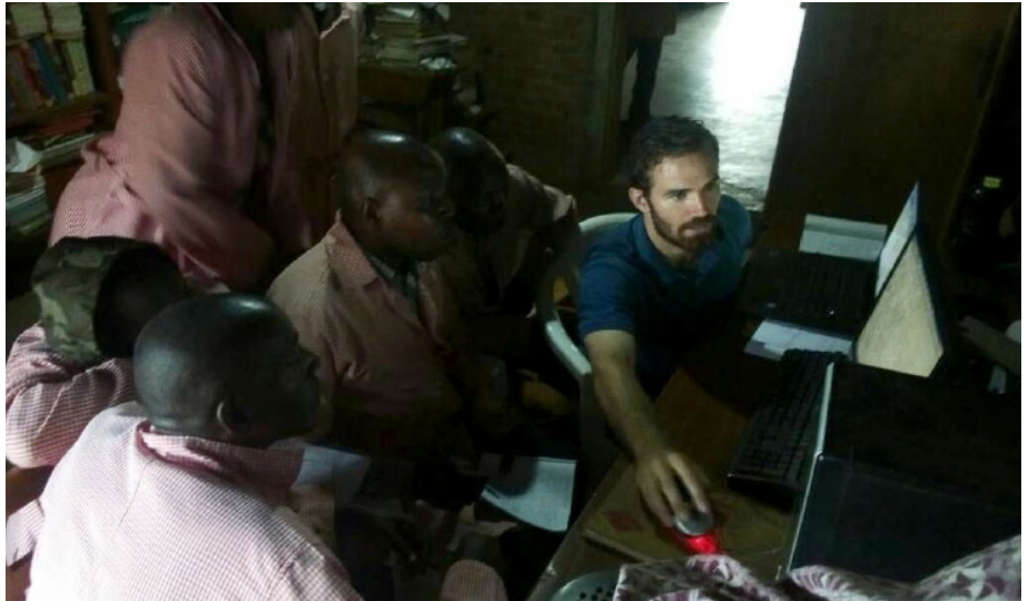
Teaching a computer class.

Tuesdays and Thursdays I work at the other school, St. Matthews-a nursery, primary school, and Jr. high. Since we're close to the end of the term, I'm helping